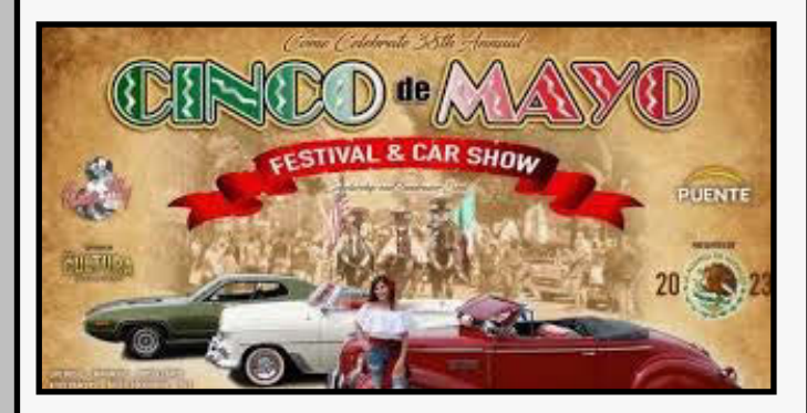
Happy Cinco De Mayo!