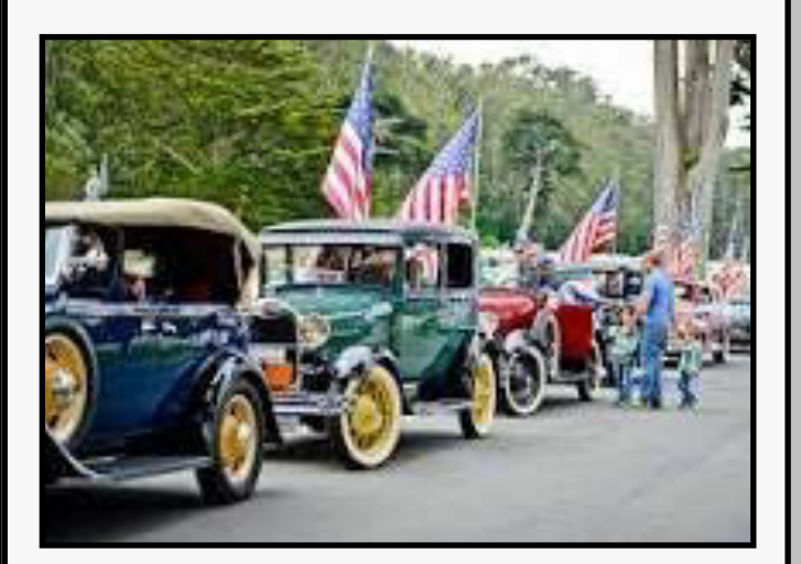
Happy Memorial Day!

<u>SPARKS TIRE & AUTO</u> All types of new and antique auto repair. (636)-945-5900 or <u>www.sparkstireandauto.com</u> 7:30 am to 5 pm M-F, 1665 Scherer Pkwy, St. Charles, MO 63303, ASE Master Certified